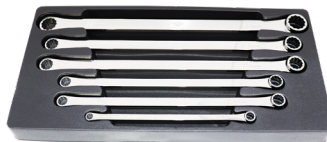
DOUBLE BOX RING SPANNER SET EXTRA LONG - 0° OFFSET METRIC - 6 PIECE