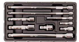
1/4", 3/8" & 1/2"DR WOBBLE EXTENSION BAR SET - 9PC